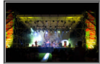
One of the three big concerts held during the 15th anniversary celebrations

During the 15th anniversary celebrations the PROEL Chairman Fabrizio Sorbi took also the opportunity to show company's ambitious goals and projects, starting from the very big one: the huge building that will be soon established next to S.Omero world headquarters, covering an area of 24.000 sm. The project - named as "Live the music" - will feature a bigger warehouse and new structures for supply chain and production, but also an auditorium, a library, a nursery, and many other facilities for employees and visitors. Having the presence of local main authorities, "the laying of the corner stone" ceremony marked official start of construction project for the new establishment that will shape a glorious future for the Italian company. Happy birthday again PROEL!