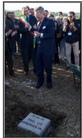
"The laying of the corner stone" ceremony marked official start of construction project for PROEL new establishment